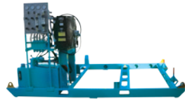
Base frame including hydraulics (650kg)

Manufactured under a quality system certified as complying with ISO 9001 by an accredited certification body. Results may vary due to fluid properties and solids contents, please consult your nearest AMC technical specialist to achieve optimum performance.