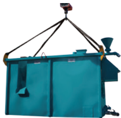
Mixing tanks (384kg)